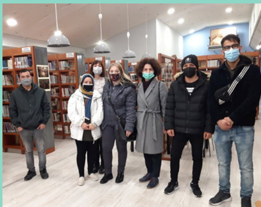
Visit and tour of the Public Library of Kilis for the adult students of the Inclusion Center!