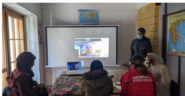
Painting workshop with Afghan painter Lida Sherzad!