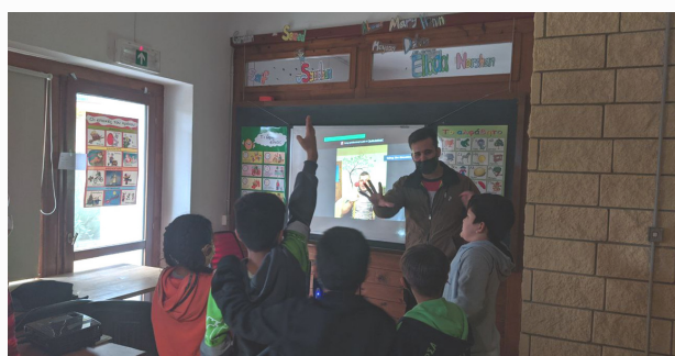
On line workshop with Red Noses International!